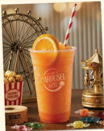
Frosé 38 Rosé wine, Aperol, lemon and simple syrup