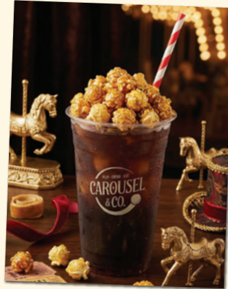
Corn & Dark 38 Corn infused tequila, coffee liqueur, espresso and charred corn syrup