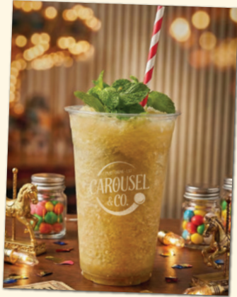
Sugarcane Madness 38 Blended Scotch, house blend sugarcane juice and mint